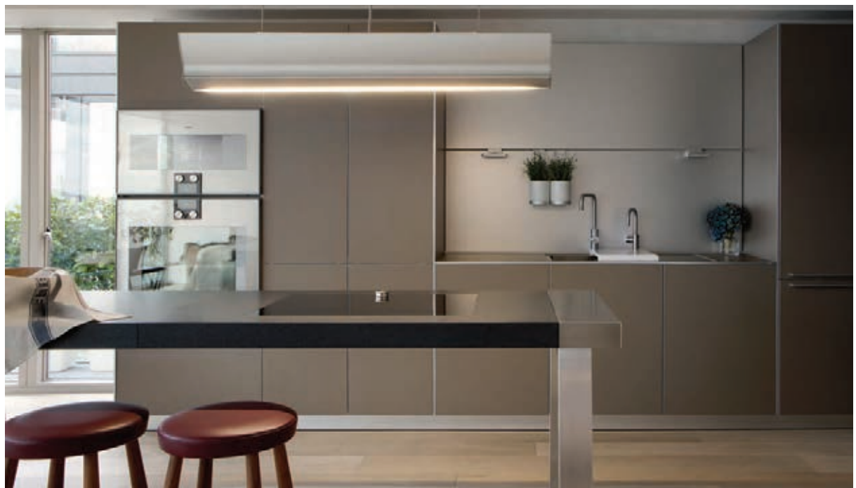
KITCHEN Bulthaup melamine resin doors, b3 natural aluminium wall panels conceal storage. Bulthaup b2 stainless steel and honed granite freestanding island. DINING Stools by Carl Hansen.